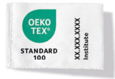
< 70 % Organic cotton

Mixtures of organic and conventional cotton are forbidden.