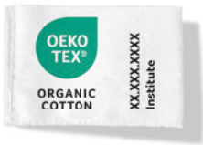
100 % Organic cotton

Three types of certification are available depending on the percentage of organic cotton: