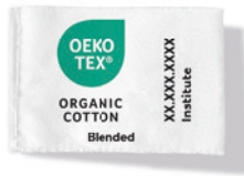
Minimum 70 % Organic cotton